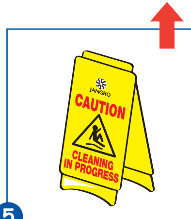
5 Remove safety signs.

Health & Safety Please refer to relevant COSHH Sheet.