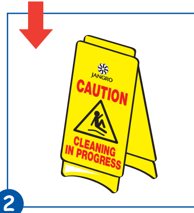
2 Place safety signs.