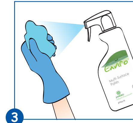
3 Spray solution onto cloth and wipe.